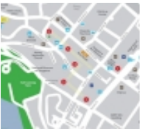
SMU Campus Map