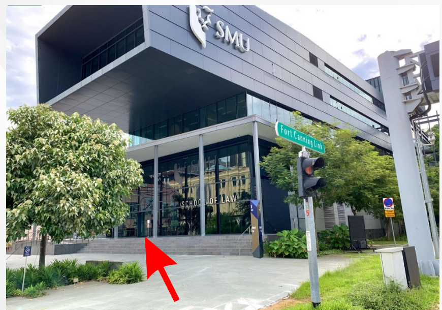
YPHSL Main Entranc