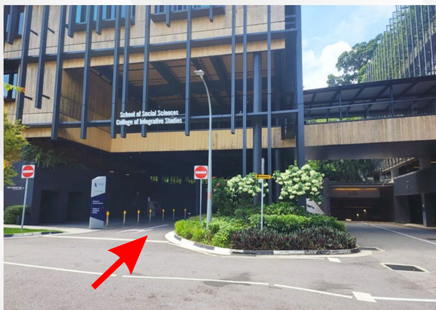
School of Social Sciences / College of Integrative Studies Roundabout

*Armenian Street is pedestrianised and it is an urban park for all to enjoy